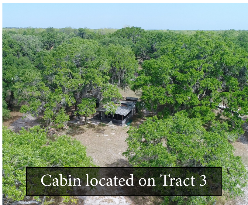
Cabin located on Tract 3